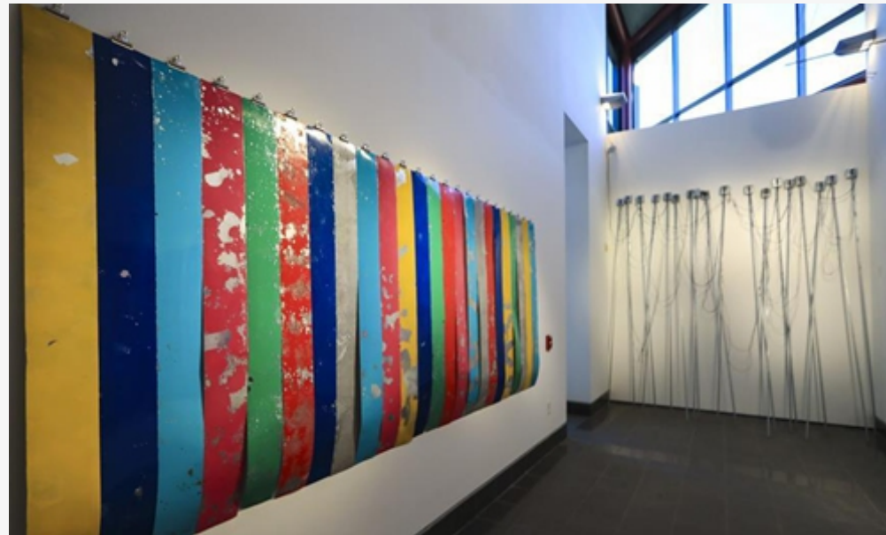
Photo taken on Feb. 25, 2020 shows a view of Endomorphism, an installation exhibition made by artist David B. Jang, at the Robert and Frances Fullerton Museum of Art in San Bernardino of California, the United States. With installations and two-dimensional works made from colorful metal