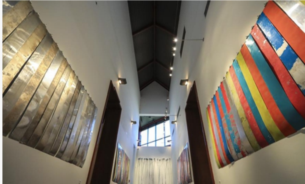
Photo taken on Feb. 25, 2020 shows a view of Endomorphism, an installation exhibition made by artist David B. Jang, at the Robert and Frances Fullerton Museum of Art in San Bernardino of California, the United States. With installations and two-dimensional works made from colorful metal strips of the mass aluminum sheets, Endomorphism is about survival and harnessing energy. (Xinhua/Li Ying)

strips of the mass aluminum sheets, Endomorphism is about survival and harnessing energy. (Xinhua/Li Ying)